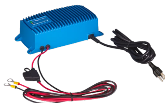
Blue Smart IP67 Charger 12/25