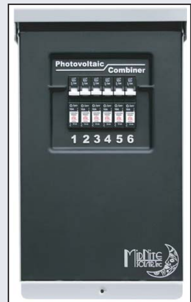
Configured for 150VDC Breakers (Offgrid)