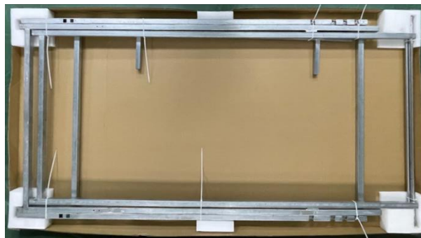
Figure 1: Bracket packaging