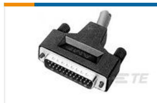
TE Part #1-747950-5 KIT,PLUG,37P,HDE,SHLD ENCLSRE