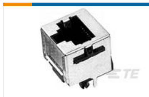
TE Part #3-1734577-4 MOD-JK,8P8C,SHD W/O LED, 50u"