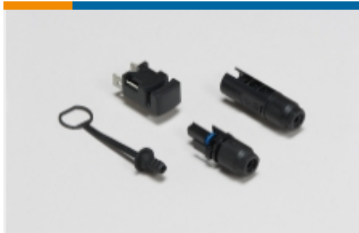
Solar Connectors &amp; Adapters(32)