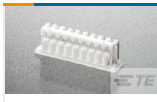
TE Part #1-440146-2 1.25mm WTB Socket,Housing,12p