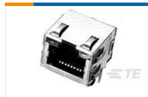
TE Part #1-406507-1 IMJ,1X1,P GRD,INSLT,LED(G/Y)SN