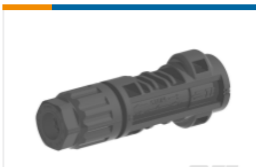
TE Part #2270025-1 SOLARLOK PV4-S Connectors