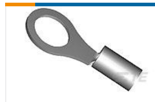
TE Part #324124 BUDG R 22-16COMM 22-18MIL 5/16